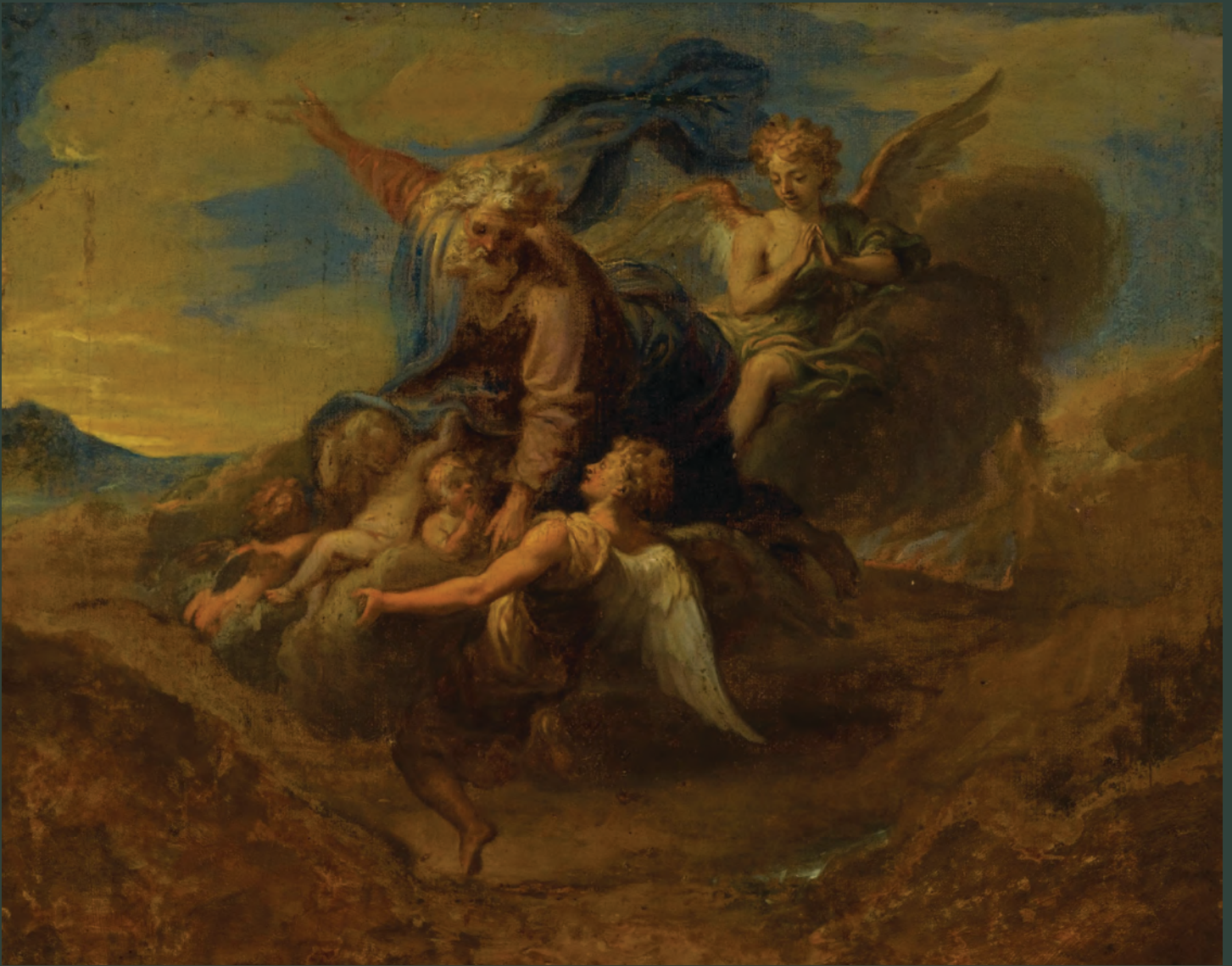
In the manner of Jean Jouvenet (French 1644-1717), Ascension , oil on canvas, 10 ¼ x 13 inches