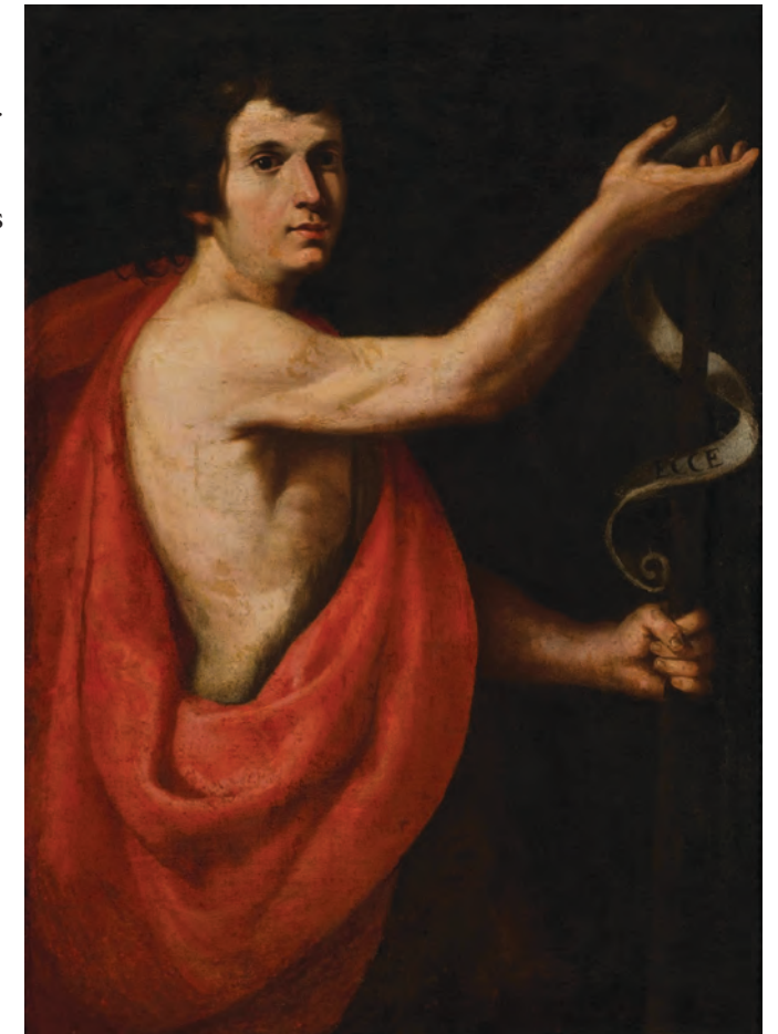
Attributed to Giovanni Baglione (Italian, ca. 1566-1643), John the Baptist , oil on canvas, 42 x 30 ½ inches