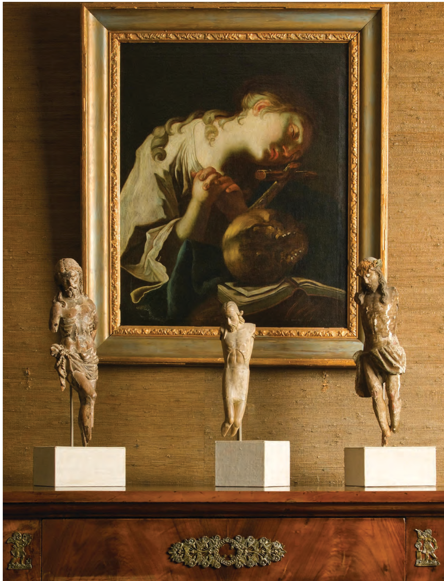
Unknown, German School, Three Antique Carved Wooden Figures of Corpus Christi , 15 ½ x 4 ¾ x 3 ½, 15 ½ x 5 x 4 ½, and 11 x 21 ¾ x 2 ½