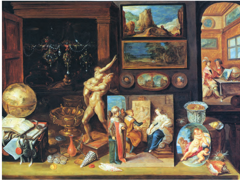
Frans II Francken (1581-1642), Chamber of Curiosities , 1636 (Vienna, Kunsthistorisches Museum)

The art museum as we know it today is a direct descendant of the so-called “Cabinet of Curiosities,” which emerged in the Renaissance. Such collections were assembled by society’s cultural élite and featured wonders from both the natural and the man-made worlds ( naturalia and artificialia , respectively). Displayed in purpose-built spaces and designed to inspire awe while facilitating learning, these wunderkammern (or “rooms of wonders”) were understood as microcosmic representations of the universe; their contents specifically installed to reveal hidden affinities and, by extrapolation, important clues to unraveling life’s mysteries. As the illustrated frontispiece from Ferrante Imperato’s Dell’Historia Naturale (Naples, 1599) makes clear, a typical cabinet might feature taxidermied reptiles, stuffed birds, and exotic shells, together with learned texts and treatises (it being assumed that nature had as much to teach us as books).