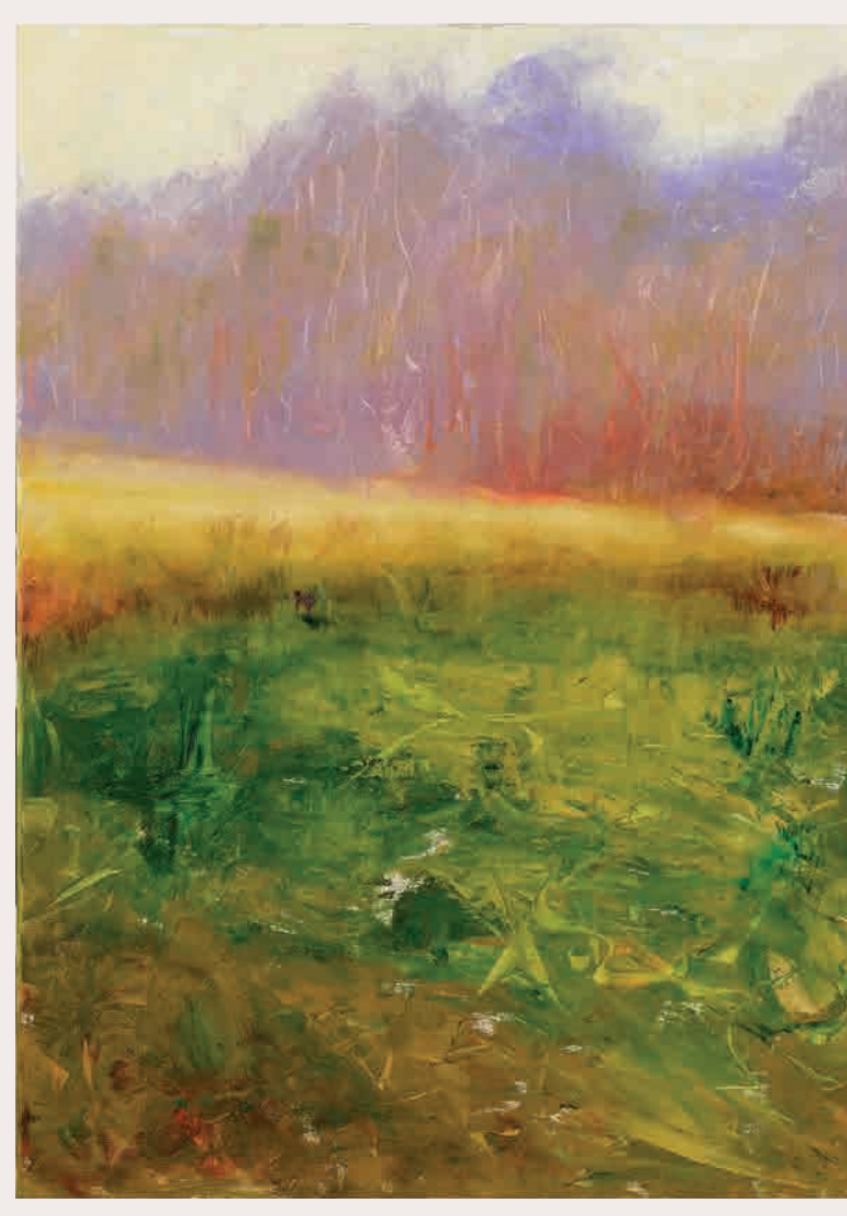
June 4 – September 18, 2015