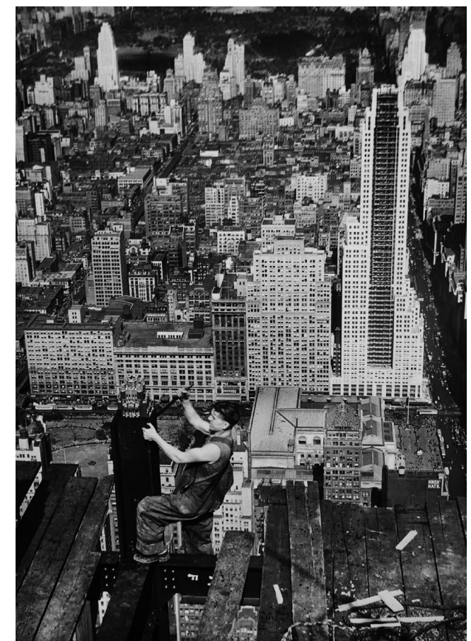
Lewis Wickes Hine, Eighty-Sixth Floor, Steel Worker, Empire State Building , ca. 1931.