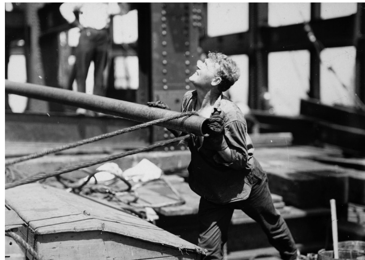
Lewis Wickes Hine, Derrick Man, Empire State Building, ca. 1931.