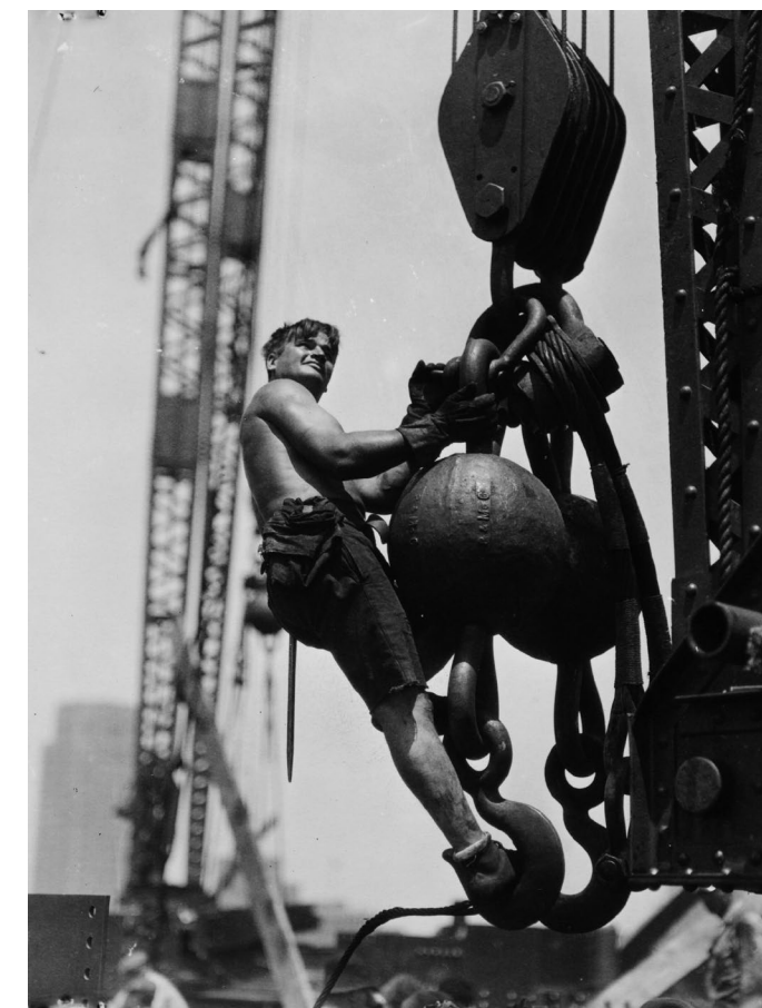
Lewis Wickes Hine, Man on a Hoisting Ball, Empire State Building, 1931.