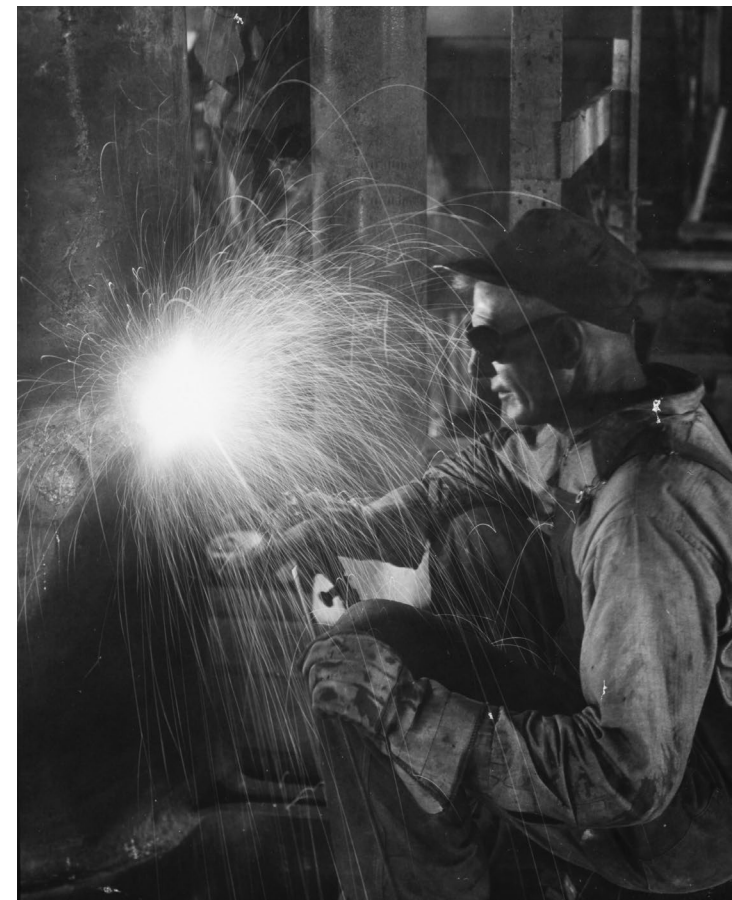
Lewis Wickes Hine, Welder at Work in Empire State Building, ca. 1931.