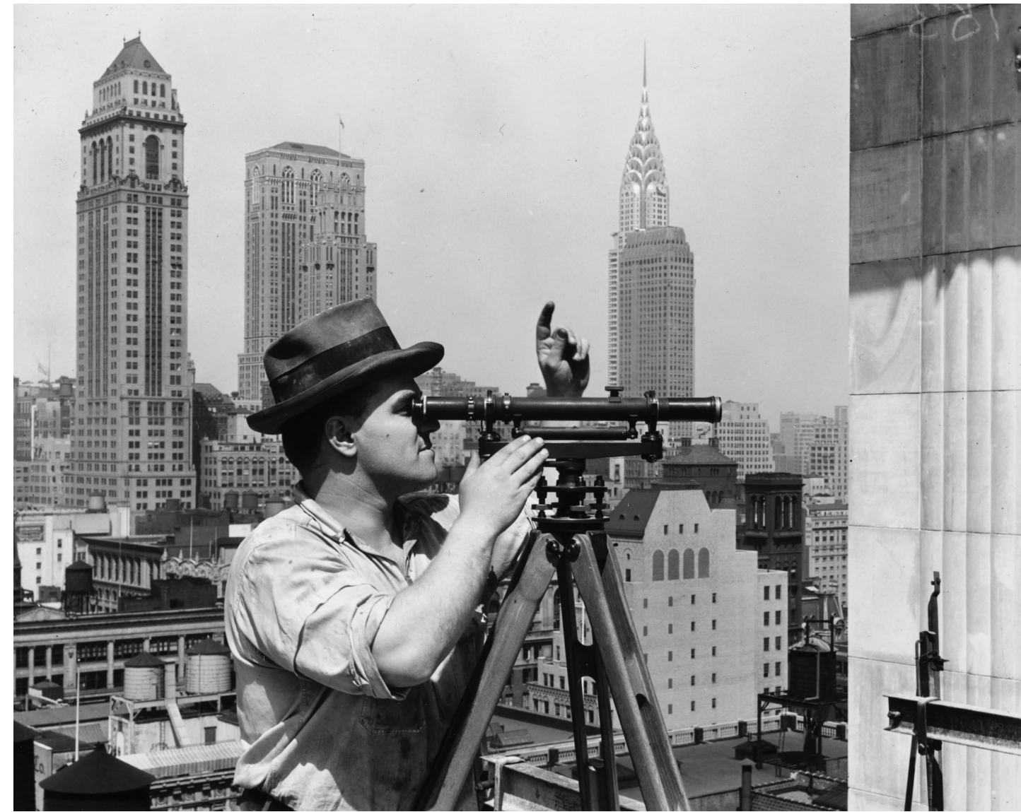
Lewis Wickes Hine, Engineer with Level, ca. 1931.

This exhibition, which was on view at Fairfield University’s Thomas J. Walsh Art Gallery from September 12 until November 26, 2013 was originally organized by George Eastman House International Museum of Photography and Film, Rochester, New York.