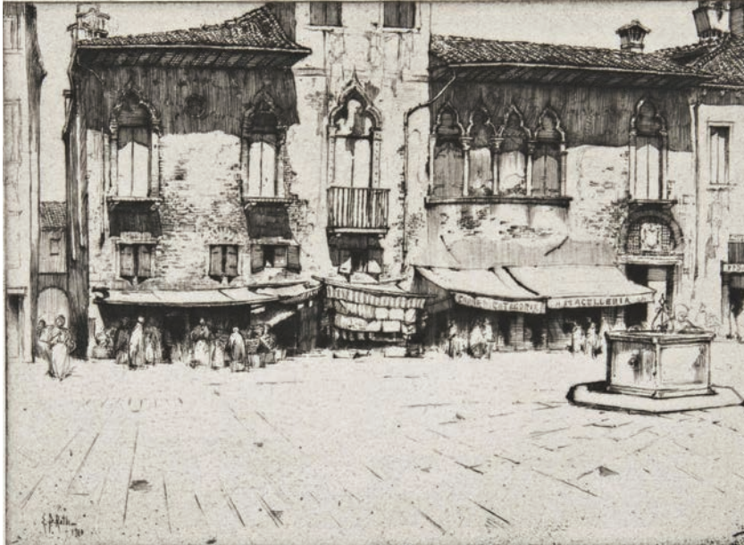
Ernest David Roth, Campo Margherita , 1913. Etching.

Etching, 35.2 x 24.8 cm (13 7/8 x 9 3/4 inches) Signed and numbered in pencil. Denker 13.