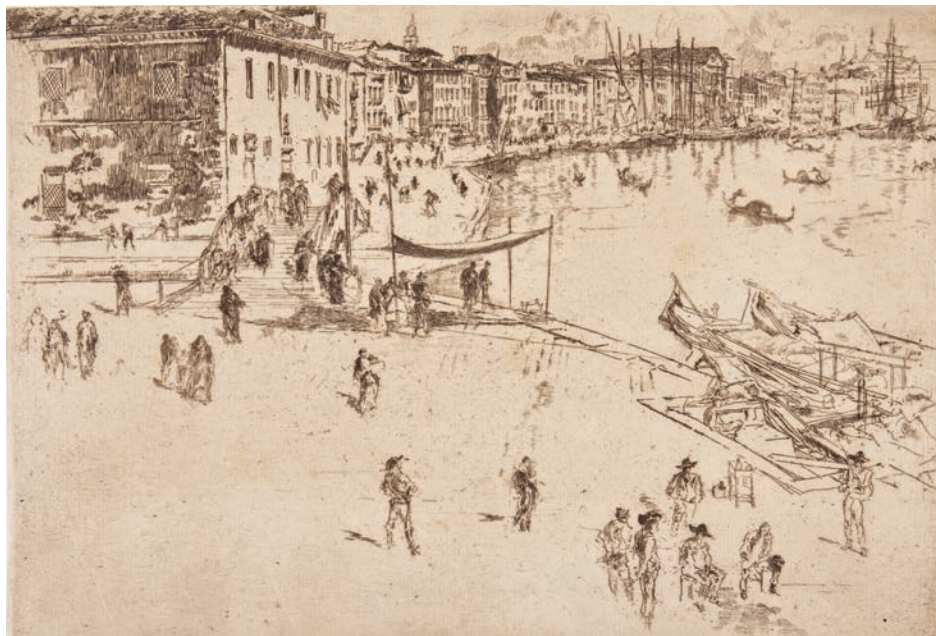
James McNeill Whistler, Riva # 2 , 1880. Etching.