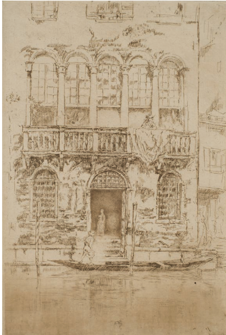
James McNeill Whistler, The Balcony , ca. 1879. Etching and drypoint.

Light also plays a critical role in photography, which at its core relies on capturing, manipulating, and ultimately translating light – both natural and artificial – into a tangible medium. Though photography was available in the 19th century, it was not only expensive but also used in a rather limited capacity. Unlike the iPhone® or related digital media tools, which today are employed by broad swathes of our population to record lived experience (especially travels), early photography was considered a tool, used by artists in particular as a means for inspiring and sometimes capturing their work. Whistler and his contemporaries were no exception to this general rule. The dramatic cropping and strange angles used in many of their sweeping panoramas of Venice, including several on view in these exhibitions, are a nod to photography and the dynamic new imagery such technology enabled. The close-up, too, was a by-product of the camera and its capacity to facilitate increased visual intimacy and exploration, as was a new emphasis on visual detail, which was antithetical to the en plein air method privileged by Impressionists and their followers. The materiality of photographs themselves may also be interpreted as having influenced the manipulation of ink on an etched or engraved plate. The resulting works frequently have a smoky, viscous feel reminiscent of images chemically created from a film emulsion and the application of ultraviolet light.