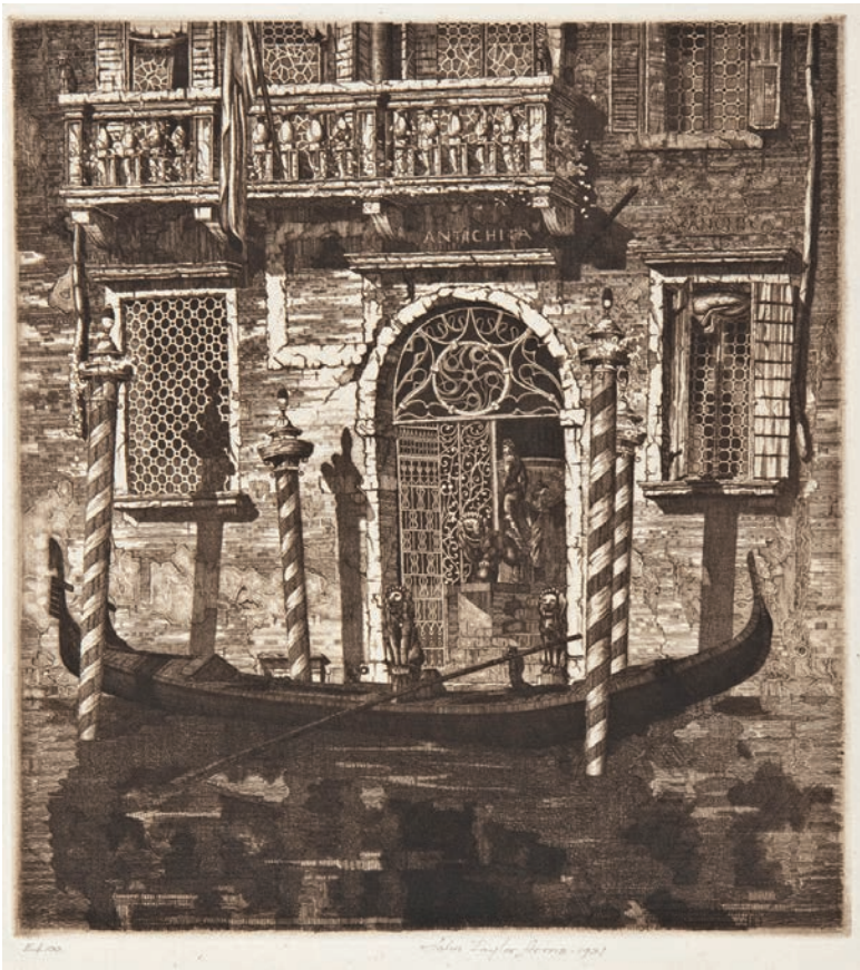
John Taylor Arms, Palazzo dell'Angelo , 1931. Etching.