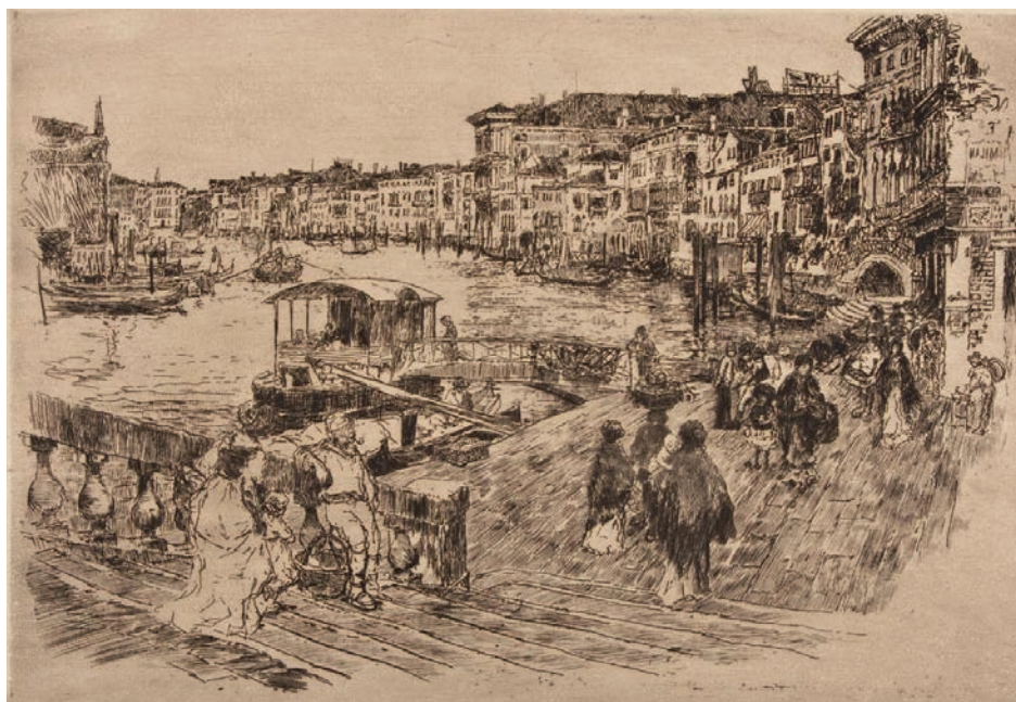
Frank Duveneck, The Grand Canal from the Rialto Bridge , 1883. Etching.

Along with light, Whistler's use of the mark – that close but controlled gesture – is what captures my attention most. His economy of articulation enhances the expressive nature of the artist's work; a remarkable feat given that incising copper (which may have a wax-based ground if ferric chloride is used for etching) feels rather like drawing in partially frozen butter. Whistler and his followers used this challenge to their advantage, valuing gesture over reality. Indeed, rather than transferring a reversed image from an original drawing on to the plate, a laborious and time-consuming practice, these artists began drawing directly onto the copper surface. As a result their city views, when printed, were mirror images: evocations rather than transcriptions. Bearing this in mind, I frequently analogize for my drawing and printmaking students the suggestive power of the mark to dancing, for the former is, in its purest form, an opening up of one's creative self to movement. Whistler may have been entertaining similar ideas when he stated, in the 1878 suit he filed against the art critic John Ruskin for libel, that artistic impressions rather than literal transcriptions of nature, are closer in spirit to music than to literature.