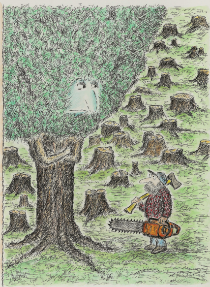
Edward Koren, The Most Unkindest Cut , 1992. Courtesy of the artist.