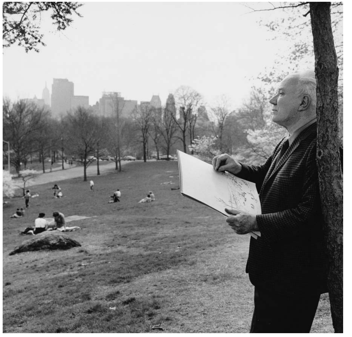
Adolf Dehn creating charcoal sketches of Central Park looking east towards Fifth Avenue and 65th Street, ca. early 1960s.