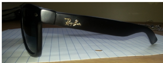
Figure 1 Trademark Infringement on Ray Band, Wayfarer Syle Sun Glasses.