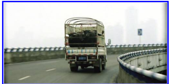
Animal images convey suffering and salvation.

Who then are the real culprits? Jia's discreet placement of an apple throughout the film teases his public to speculate on its meaning. Almost everyone in this film is in proximity to an "apple." Da Hai is ready to bite into an apple-like tomato; Zhou San'er peels an apple for his son; Xiao Yu inherits the fruit knife that her departing lover brought to peel apples on his trip but left behind at the train station; and of course,