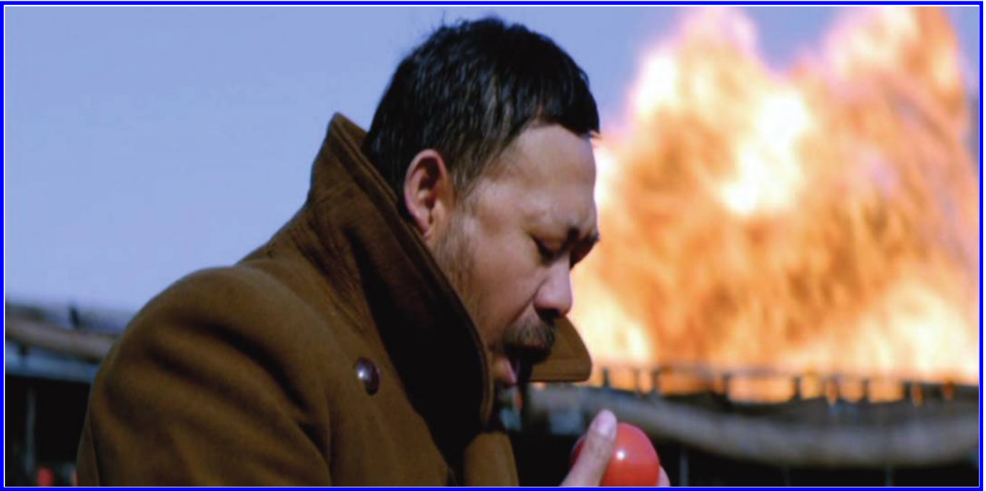
A Touch of Sin thrusts audiences into the thick of the action.

scene slowly unfold, the audience is thrust right into the thick of the action. Jia's attention, so keenly trained on quotidian life, has now shifted to out-of-the-ordinary events and to moments already at a boiling point. A mise-en-scène of violence has emerged, one that is poised yet dynamic, gripped by the tension between immediate action and theatricalized abstraction.