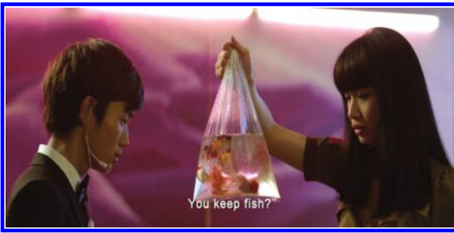
A lighthearted scene in a sex club.

to a small world of their own where they communicate quietly through sparse words as well as silence, sharing an intimacy that swings between sympathy and love. Such scenes, however, often dissolve as fast as daydreams: the connection is too delicate to withstand the buffeting that the two must brave on their own; their vulnerability, both social and economic, determines that all will be for naught.