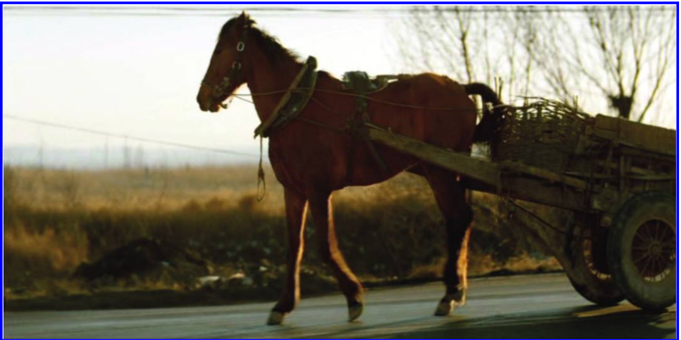
A scene reminiscent of Béla Tarr's Turin Horse (2011).

Jia invents a new expressive style to attempt strong sensory, emotional, and ethical impacts. First, rather than shooting fiction films as if they were documentaries, as he often did in the past, this time he crafts materials of documentary nature into a real “fiction.” He does so by reconfiguring the four isolated real-life incidents into stories taking place in a unified