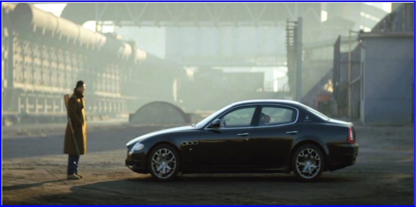
A scene reminiscent of Antonioni's Red Desert (1964).