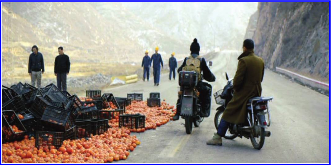
A fleeting meeting on the road and on screen in A Touch of Sin .

gaze of passersby like Da Hai and Zhou San'er, becomes no different from the crushed tomatoes on the ground. Intriguingly, Da Hai himself will later succumb to the cruelty of the crowd.