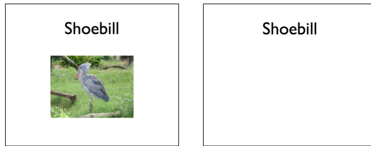
Figure 1. Example of an animal name with and without a photo.

were also visible. None of the photos depicted animals eating. Animal names appeared equally often with and without photos.