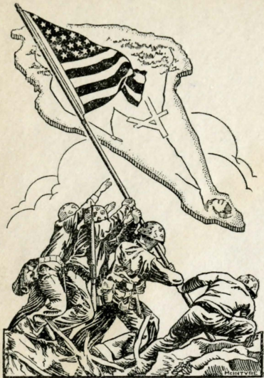
U. S. MARINES RAISING THE AMERICAN FLAG ON IWO JIMA