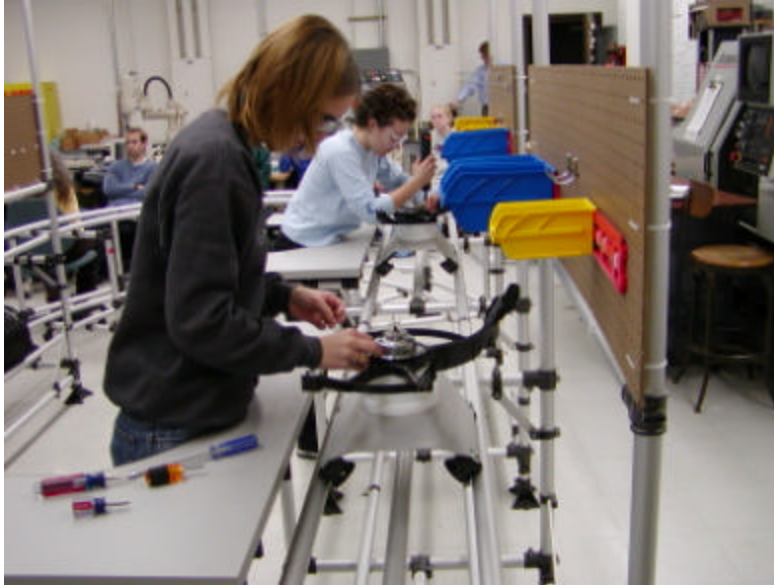
Figure 1. Experiential Assembly System

The case study used in this experience was an automobile radiator fan assembly shown in Figures 2 and 3. This consisted of 50 assemblies donated by a local first-tier supplier to one of the big-three automakers. The assembly consisted of a base shroud, a motor subassembly, a 3-blade fan, three \frac{1}{4} "-20 flat screws with washers, and a reverse-thread wing nut. Assembly fixtures were manufactured in-house and attached to the roller pallets to facilitate the assembly process and provide stability during transportation.